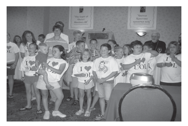
Johnson City welcomes all UOL members to the 61st Annual Convention!

62nd ANNUAL UOL CONVENTION Sts. Peter and Paul, Youngstown, OH July 22-26, 2009 We look forward to seeing you in Y-town!!