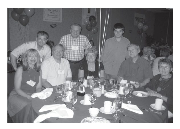
All UOLers enjoyed the local band Old Friends