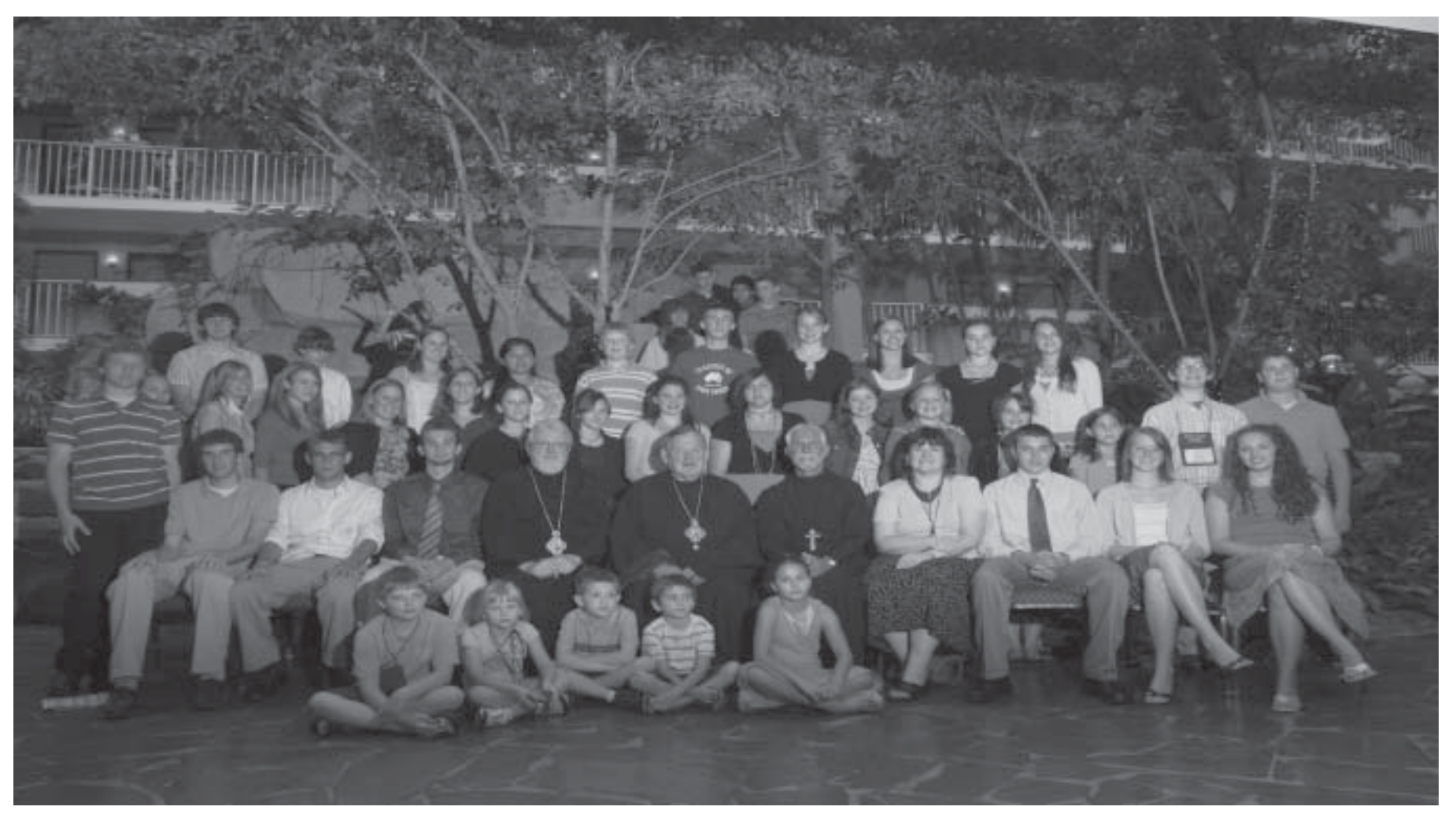
46th Annual Junior UOL Convention