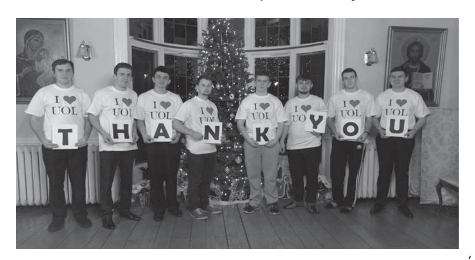
Thank you to all members of the Ukrainian Orthodox League, supporters of St. Sophia Seminary, and to those who attended this past year's Christmas at the Seminary Fundraiser. The t-shirts worn in the picture were a gift from the UOL to the seminarians.