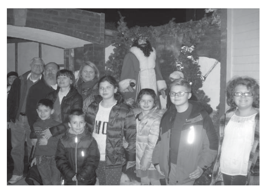
100,000 lights. It was wonderful to share these Christmas classics with children and families who had never seen these exhibits. Our final stop was the more