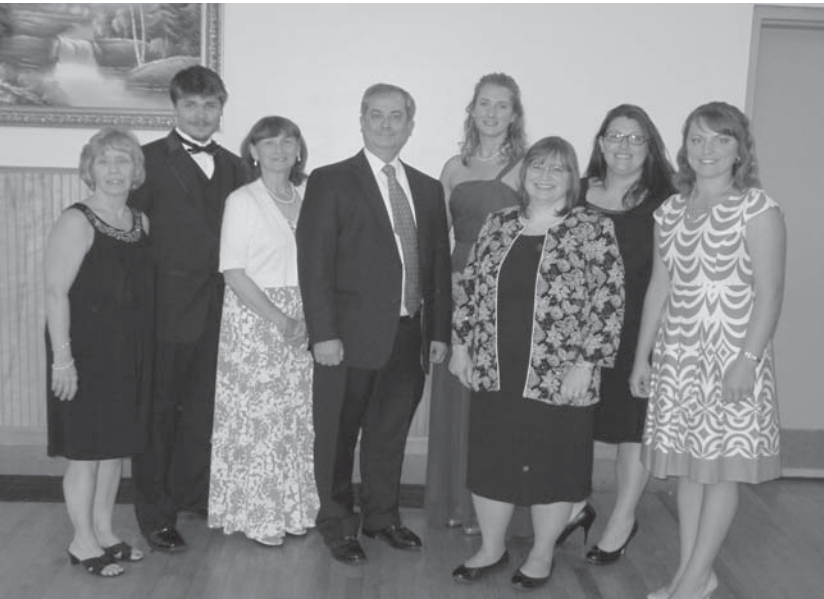
2014-15 National Executive Board

Congratulations to the Northampton Chapter!