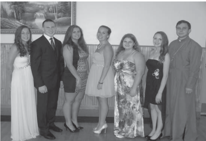
2014-15 Junior National Executive Board