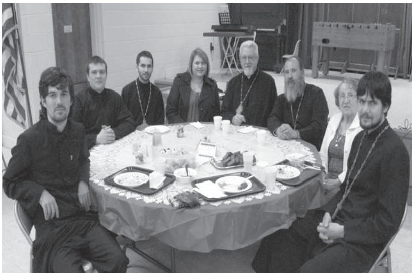
Members of the newly formed chapter in Philadelphia

We look forward to congratulating them all in person at the 66 th UOL Convention in Parma, Ohio. May God grant you many years of upholding the UOL motto of “Dedicated to Our Church and Devoted to Its Youth.”