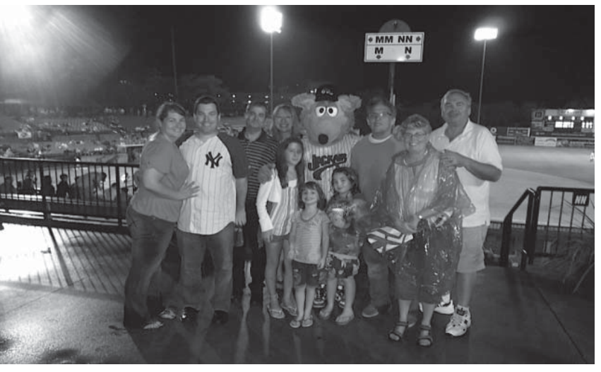
our spirits were not dampened. We donned our ponchos and stayed until the end of the game. As the skies cleared the fireworks display at the close of the game was spectacular. We all had a great time and are looking forward to attend again next year.