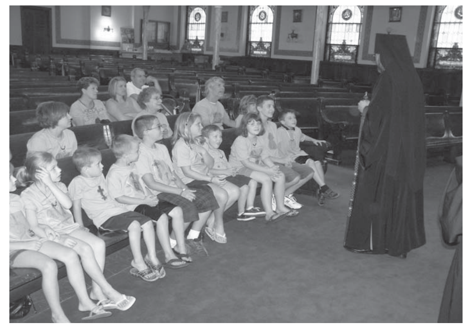
No one would leave until theirs was done so warm Prosphora was sent home with all.

to the story were completed by students along with a door hanger that was decorated with all kinds of fish and sea creatures. This was followed by a craft in which