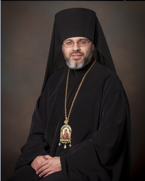
Greetings in our Lord!

Would you like a life changing and never-to-beforgotten experience? If so, it is our joy to invite you to join us on a trip to the Holy Land, where you will find a new dimension in the understanding of Biblical history and the life of our LORD. We will visit places where our Savior walked, lived, taught and performed miracles - where He was crucified and rose from the dead. So, come and join us on a journey to the land of the Bible where you will see, touch, feel and experience the land of the Bible. It is still basically as it was in Biblical times. If you have dreamed of understanding and experiencing more about the origins of Faith and want to know personally the land that Christ walked and ministered, let us guide you in bringing Holy Scriptures to life.